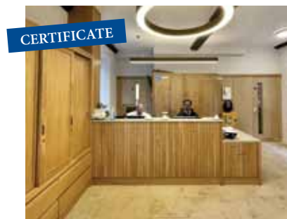
PORTERS' LODGE, CORPUS CHRISTI COLLEGE Owner: Corpus Christi College Architect: Purcell UK Main Contractor: Beard Construction Structural Engineers: SOLID Structures & Infrastructure M & E Consulting Engineer: JDA Group Ltd