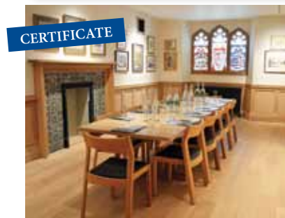
WINTER COMMON ROOM & NEW ROOM BACK OF HOUSE AREAS Owner: Magdalen College Architect: Robinson Thorne Architects Main Contractor: Richard Ward (Oxford) Ltd College Surveyor: Magdalen College