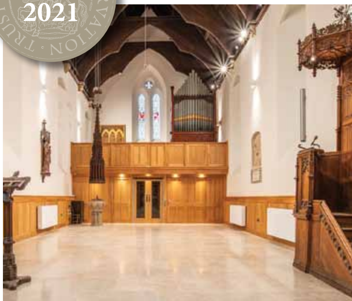
THE NEWMAN MEETING PLACE PROJECT, ST MARY & ST NICHOLAS CHURCH, LITTLEMORE Owner: Church of England Architects: Conservation Architects LLP Main Contractor: Hillsdon Construction