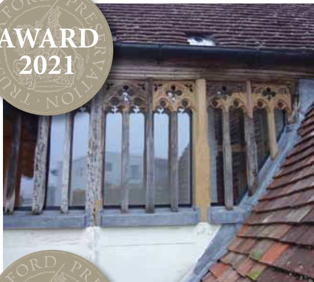
REAR GALLERY WINDOW RESTORATION, 26 & 26A EAST ST HELEN STREET, ABINGDON Owner: Oxford Preservation Trust Building Conservation: Owlsworth IJP Ltd Leadwork: Maelstrom Leadwork