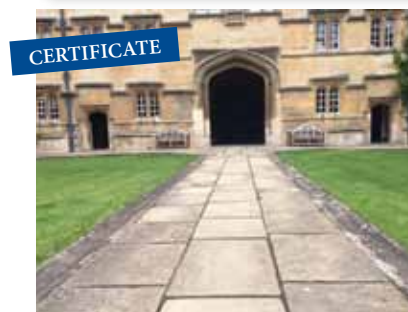
MAIN QUAD REPAVING AND DINING HALL CORRIDOR RAMP Owner: University College Architect: Original Field of Architecture & Landscape Landscape Contractor: Hickman Brothers Landscaping Joinery Contractor: Broadleaf Joinery College Surveyor: University College