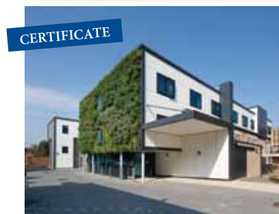
EXTENSION AND IMPROVEMENT TO ST. LUKE'S HOSPITAL, LATIMER ROAD, HEADINGTON Owner: St. Luke's Hospital Architect: Oxford Architects LLP Main Contractor: Benfield & Loxley (Builders) Ltd Landscape Architect: RALD